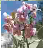
Arctostaphylos manzanita Common manzanita