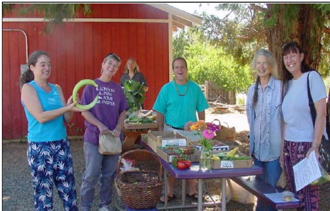
Fun with food at the gardeners' market

Please spread the alert, and if you can find your questionnaire from Herger, send it in with a big NO on #8. You can also write him at: 55 Independence Circle, Suite #104, Chico, CA 95973. This is an issue that will never go to rest and requires our collective vigilance.